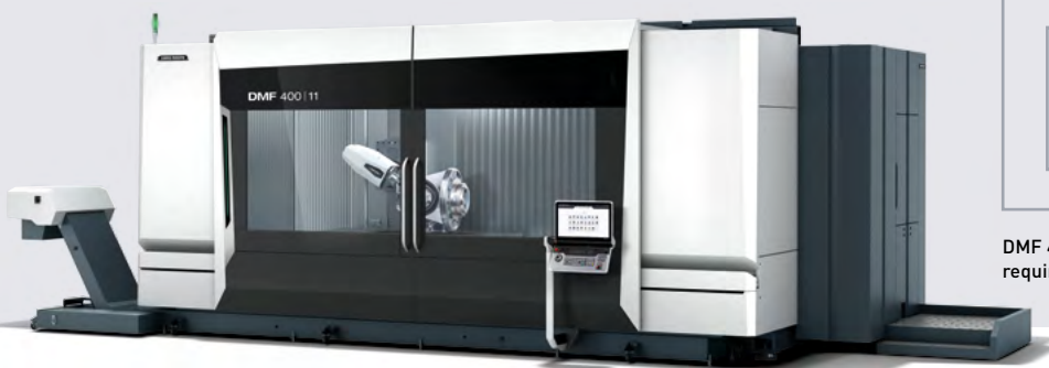
DMF 400|11 – perfect for machining large with highest requirements.

DMF 400|11 – Based on our pioneering travelling column concept, the currently largest model in our newly developed DMF series impresses with 400 mm more X-travel and 150 mm more travel in the Z-axis compared to the previous model. The robust design results from the cast-iron machine bed, three linear guides in the X-axis and ground and cooled ball screws, among other things. This is what makes the travelling column machine perfect for machining complex large components – from structural parts and long beams to components for die and mold making. With travels of 4,000x1,100x1,050 mm, the DMF 400|11 offers many possibilities for machining. The optional, quick-to-integrate separating wall divides the machining area into two workspaces if required, enabling components to be set up during machining. The modular system is complemented by an FD rotary table for demanding milling and turning operations.